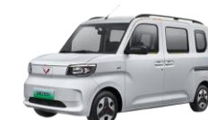
Zhiguang EV- CE110M