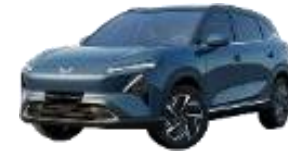
F510S Xingguang S