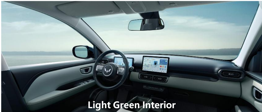
Light Green Interior