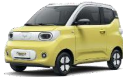
E50 MCE Pro