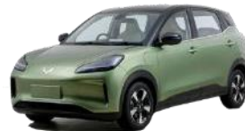
E260 MCE Bingo Plus